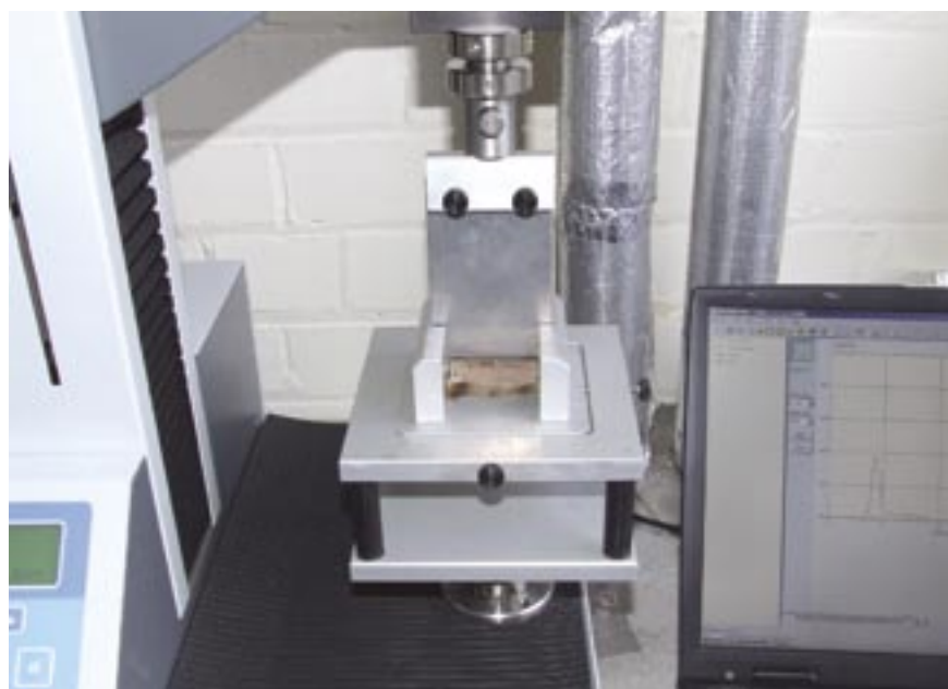
Figure 2: SAC custom-designed jig for rapid Slice Shear Force measurement

A different method of shear force testing, the rapid Slice Shear Force test was developed in the US and first results published in 1992 2,3 as part of a beef tenderness classification system. The Scottish Agricultural College is trialling